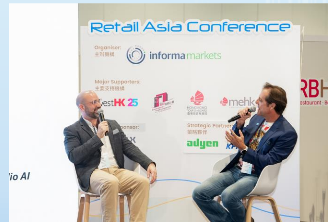
Technology Showcase-Fireside Chat