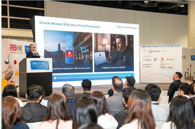
Session 1: AI & Retail Technology Evolution