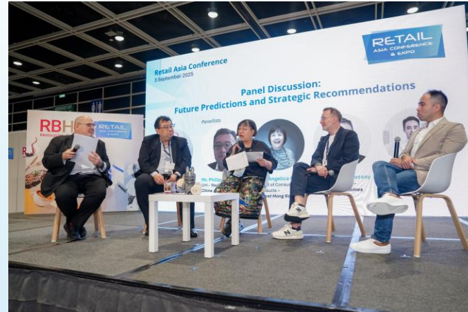
Session 2: Innovation & Future Retail Experiences