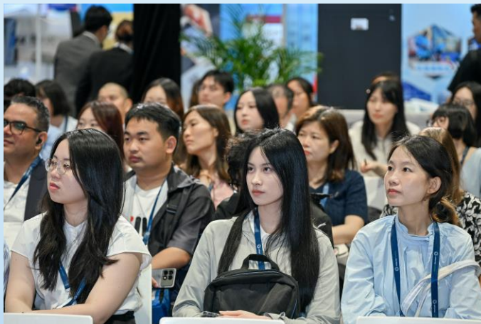
Conference Attendees Listen Attentively