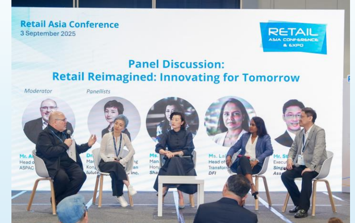
Session 3: Strategic Market Expansion & Other Developments